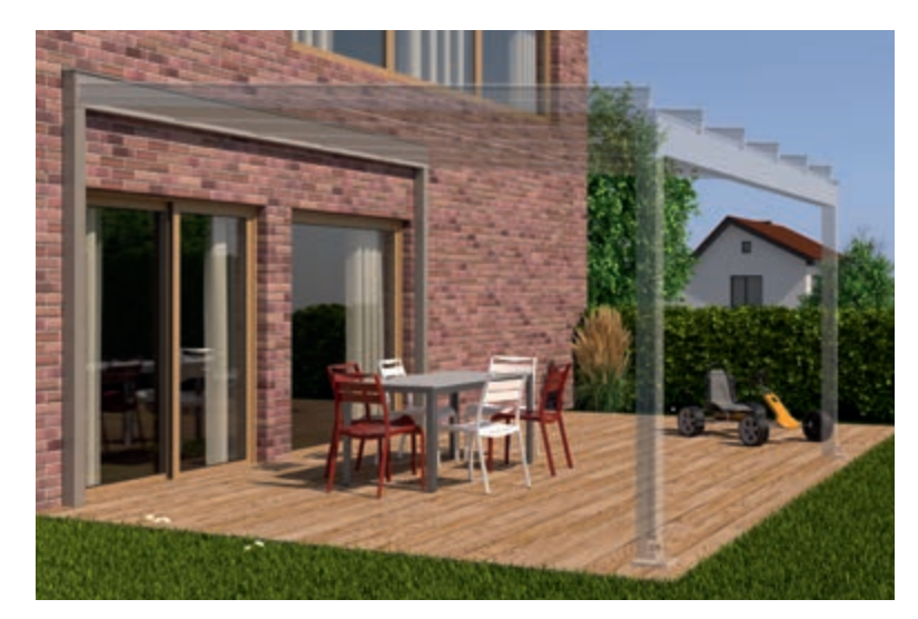
Sample brick facade, Supporting Wall Connection Frame and Terrazza Sempra