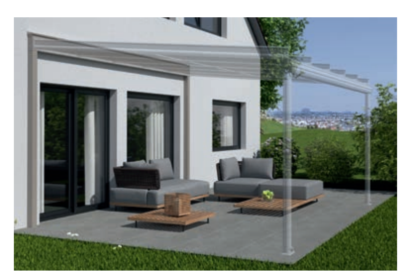
Sample heavily insulated house facade, Supporting Wall Connection Frame and Terrazza Originale