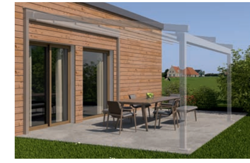
Sample prefabricated house on studding Supporting Wall Connection Frame and weinor PergoTex II